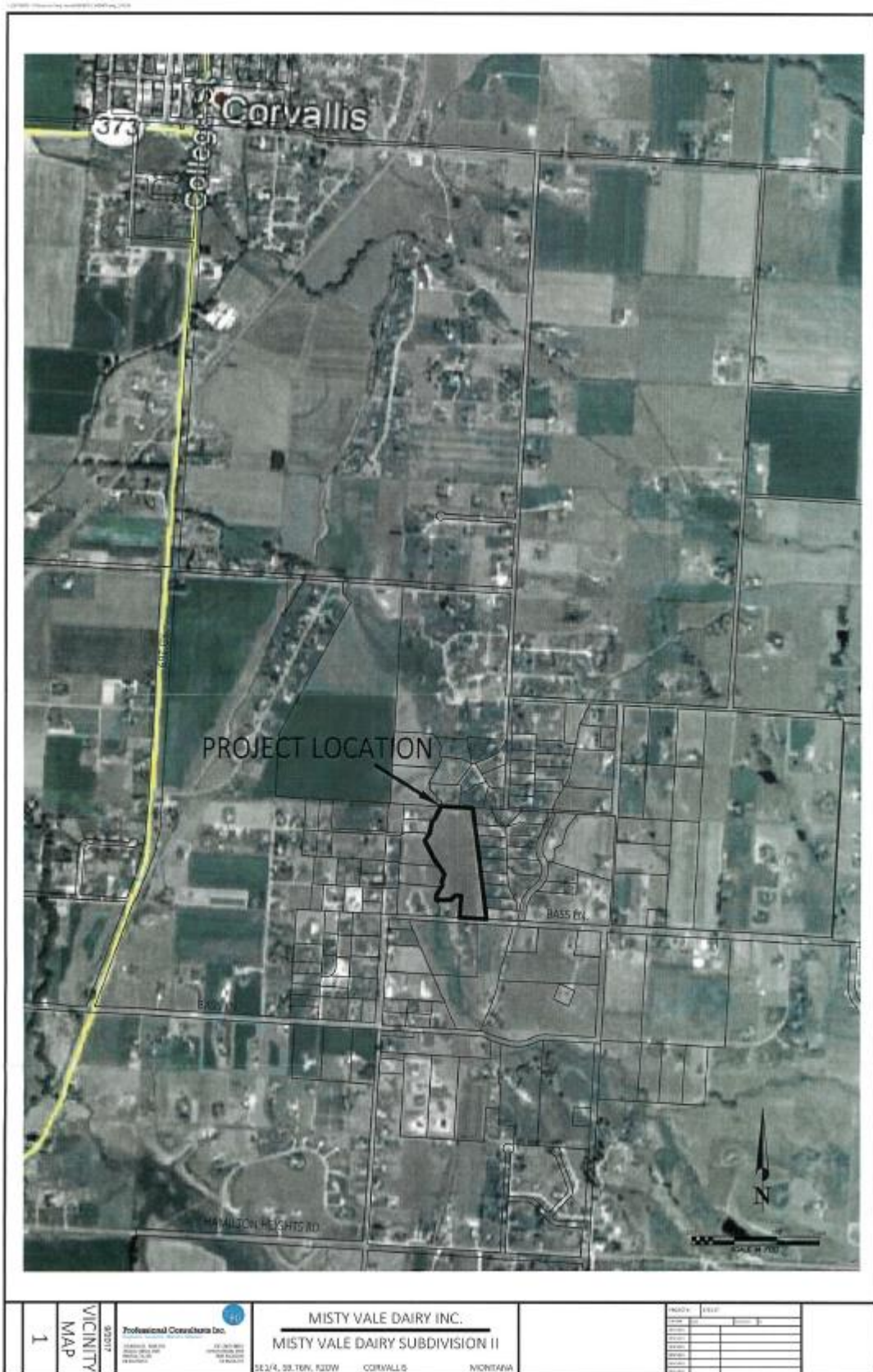
Location Map (Source Data: Application Packet)